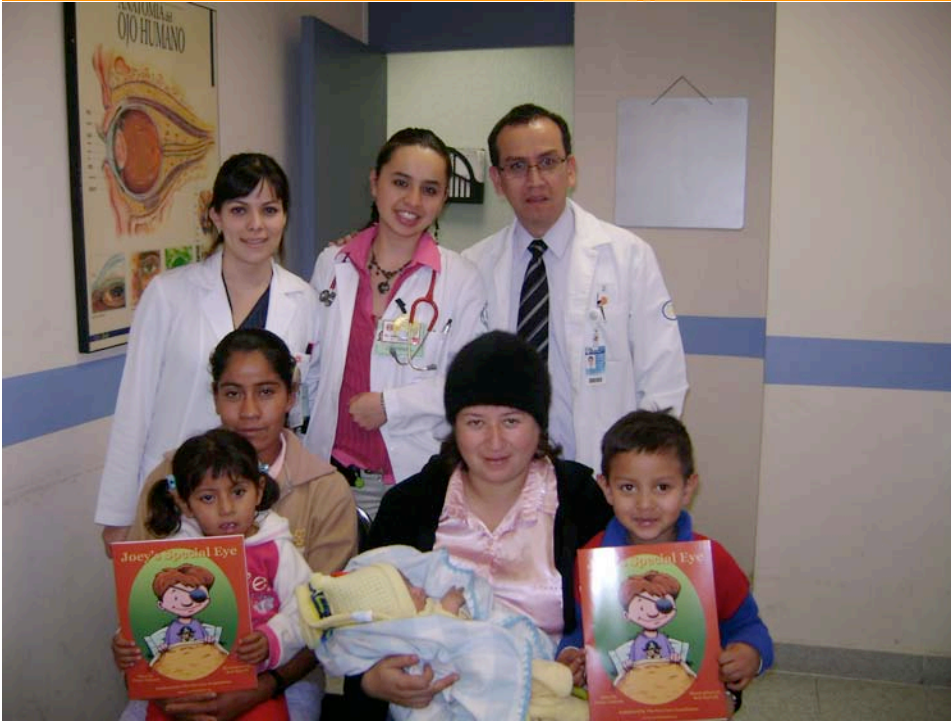
Hospital Infantil de Mexico Federico Gomez